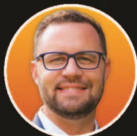
JAMIE DEW President New Orleans Baptist Theological Seminary